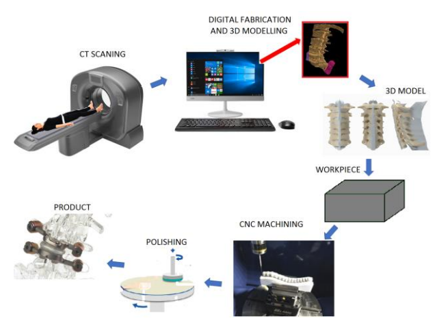
Figure 3. Vertebra manufacturing process based on CT scan images

3D printing manufacturing technology showed its benefits especially in this complex area of designing and fabricating spinal implants. The process starts from 3D scanning, as shown in Figure 3.